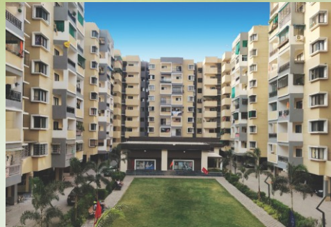
Actual Photograph of G, H, I & J Block